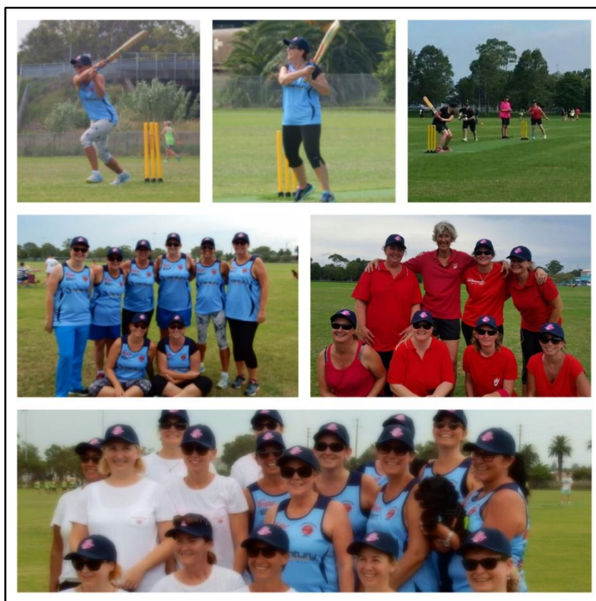
Newcastle City (blue), Peanut Gallery (red), Wicket Witches (white)

Next week sees Newcastle City up against Tomaree Turtles, Wicket Witches facing No Middle Stump (both at Waratah Park), and Peanut Gallery taking on Fine Legs at Smith Park. All games commence at 4pm – get along to cheer the women on!