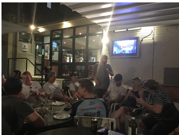
Family BBQ at the Bennett Hotel